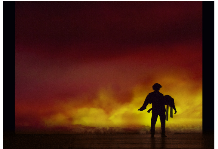
Oedipe (video scenography for a play) / Direction & choreography: José Besprosvany